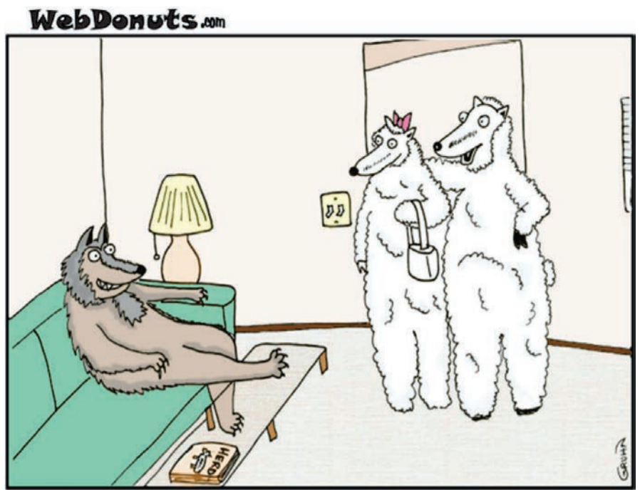
So...this is the roommate. Awkward....

It goes without saying that Canadians are deeply concerned about a rise in violent crimes. However, frontline police offices are already a scarce resource, particularly in rural Alberta. The decision to potentially use officers, already spread thin dealing with criminal investigations, is not only counterintuitive —it could prove very reckless.