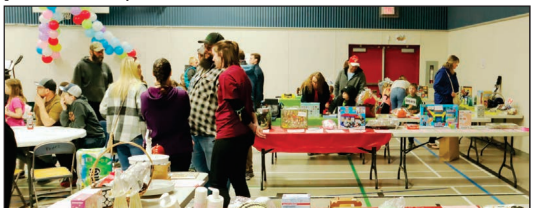
This year's YKCS Auction Fundraiser featured both live and silent auctions.