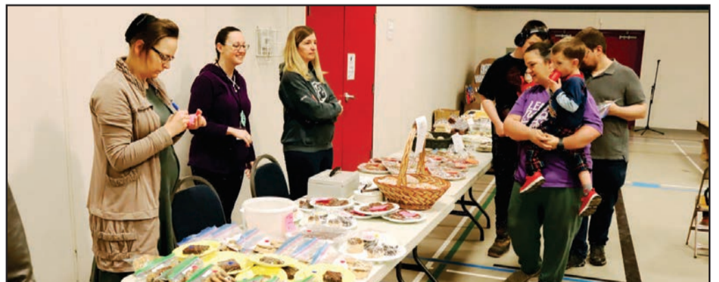
The YKCS Auction Fundraiser on April 22 featured a bake sale table with a great selection of goodies.