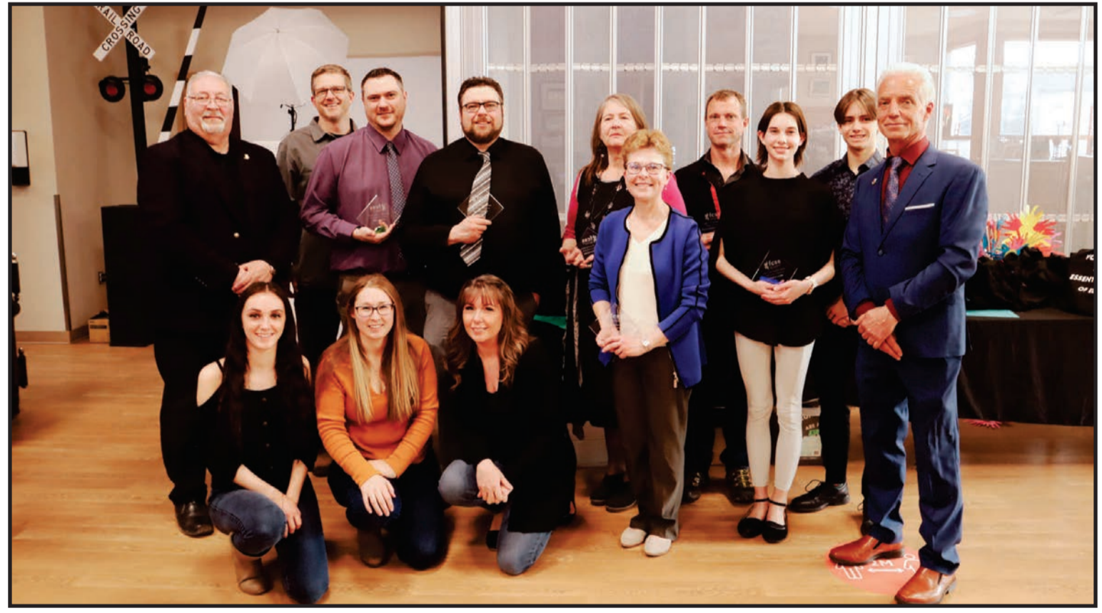
Volunteer award recipients and presenters during the annual Volunteer Appreciation Awards held on April 21 at the Galloway Museum.