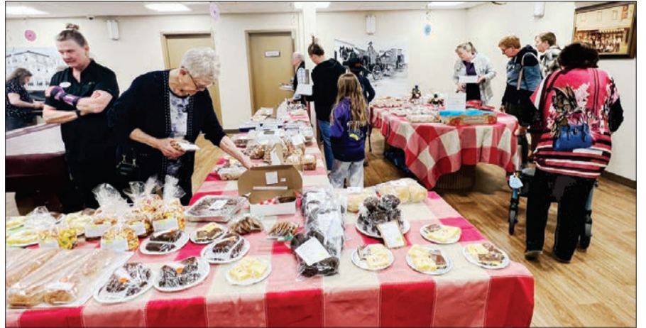
The Parkland Lodge Auxiliary held their Annual Tea and Bake Sale on April 22.

During the event there were lots of smiles around the room. Everyone seemed to be enjoying the social outing. Besides tea or coffee, guests had the choice of either ham salad, salmon salad or egg salad open face buns and dessert. The Auxiliary also had two volunteers from Vanier Community Catholic School there helping to serve. (see thank-you pg 9)