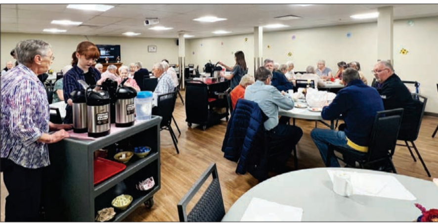
Tea, coffee, and light lunch were served during the annual Parkland Lodge Auxiliary Tea that was held on April 22.