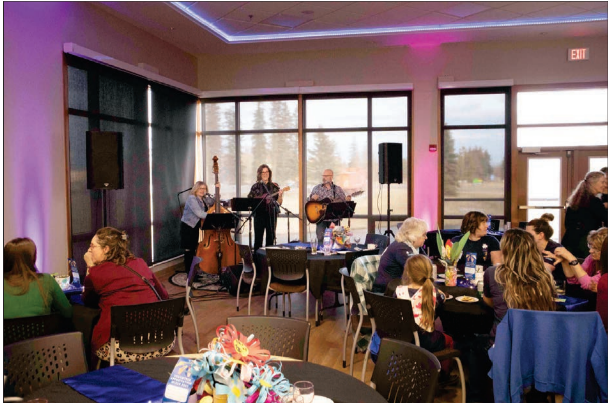
Local band 'Not to Scale' performed at this year's Volunteer Appreciation Awards held April 21 at the Galloway Museum.