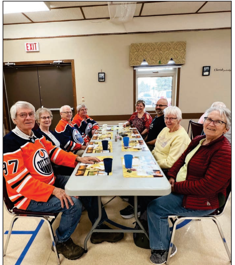
Looks like some Oilers Fans were at the Pioneer Cabin for lunch on April 25th. Every Tuesday the Cabin offers a homemade soup and sandwiches and everyone is welcome to attend for a reasonably priced lunch.