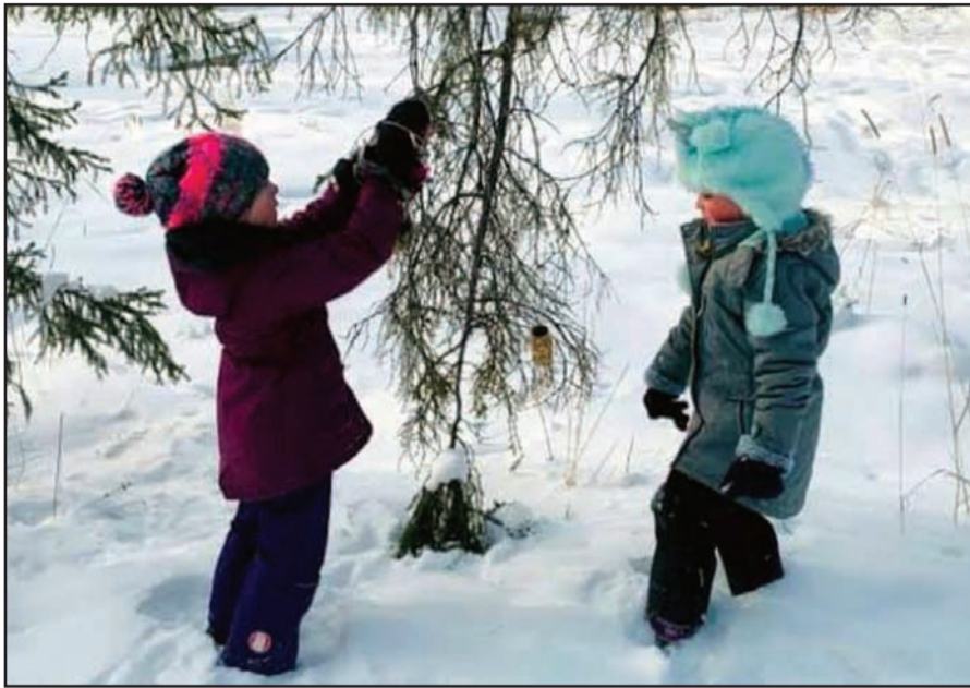
Lots of fun was had at the Family Day Unplugged events from February 12-21. Pictured are two participants hanging their new bird feeders up at Willmore Park.

at the Green Shack and followed along the river, looping through the Bike Skills Park, and ending at the bottom of the toboggan hill.