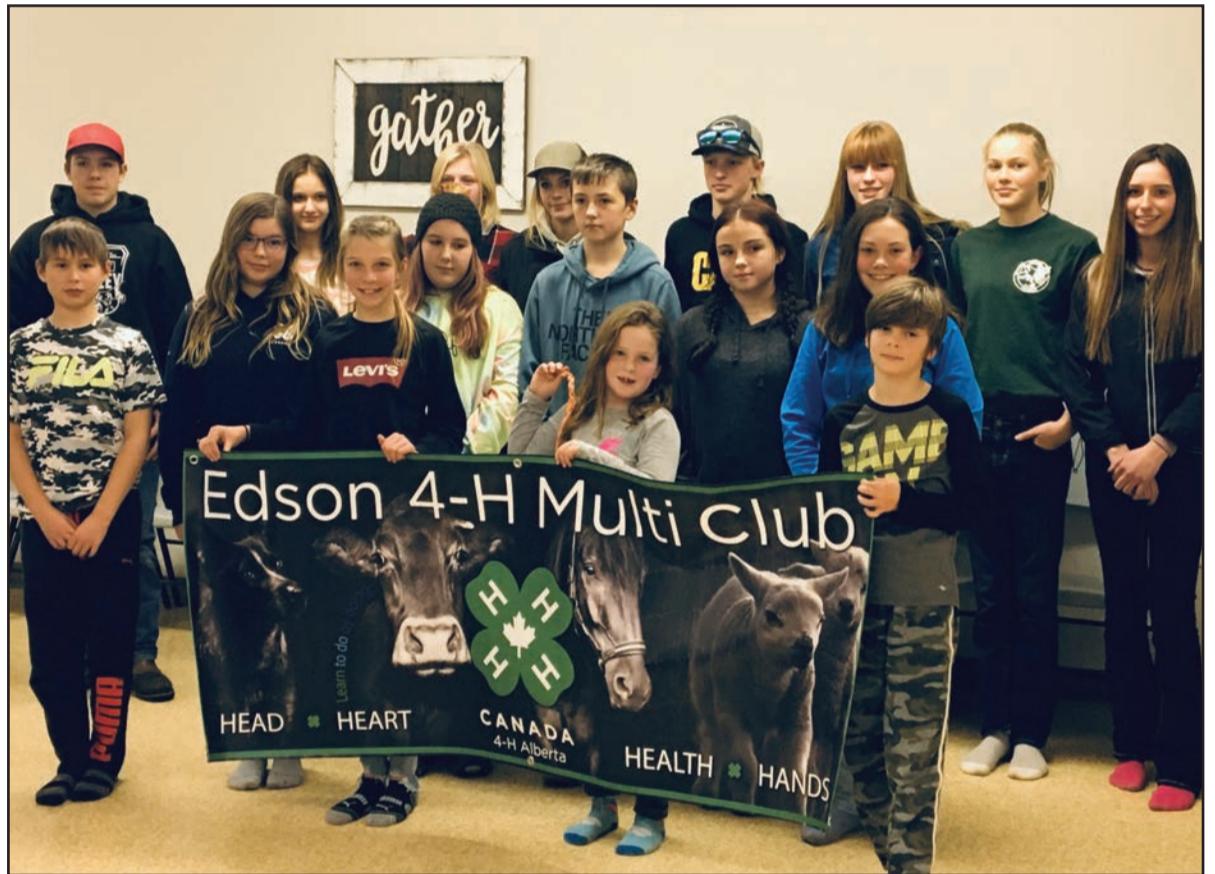
The Edson 4-H Club showing off their new banner. Photo taken September 2020.