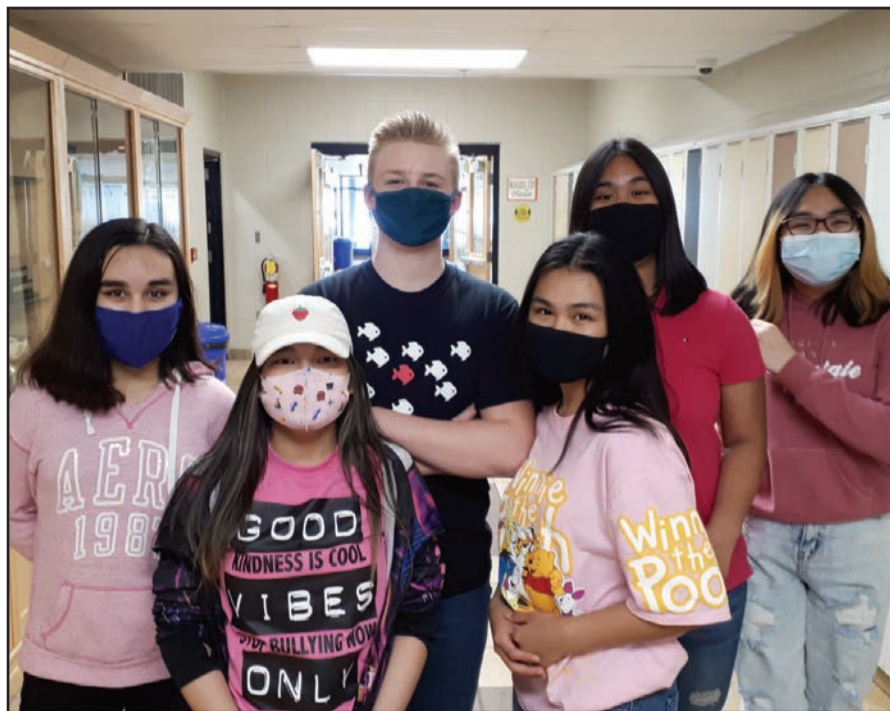
Pink Shirt Day was celebrated across the country on February 24th as a way to raise awareness and put a stop to bullying. Holy Redeemer students got right into the swing of things by wearing pink to show their support. Here, a group of grade 8 students who also sit on Students' Union went around the school handing out coupons from A&W to anyone wearing pink. #pinkshirtday #wheretoturn #hrhrebelsproud