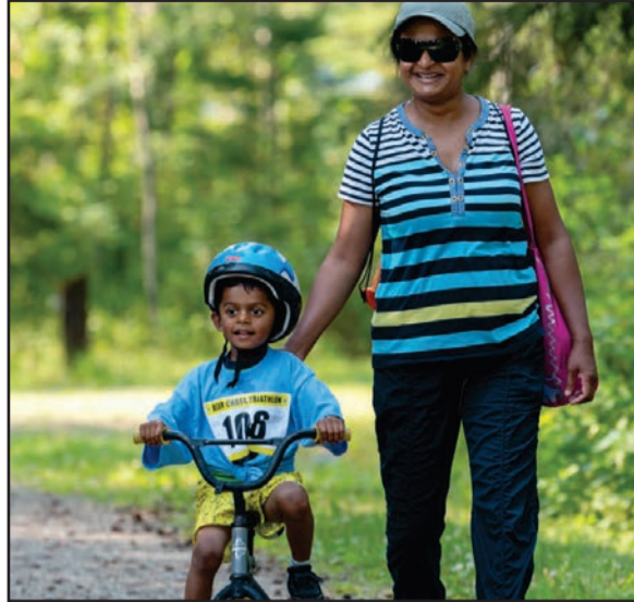
This young athlete participated in the Bear Chase Triathlon on July 20 at Bear Lake Park.