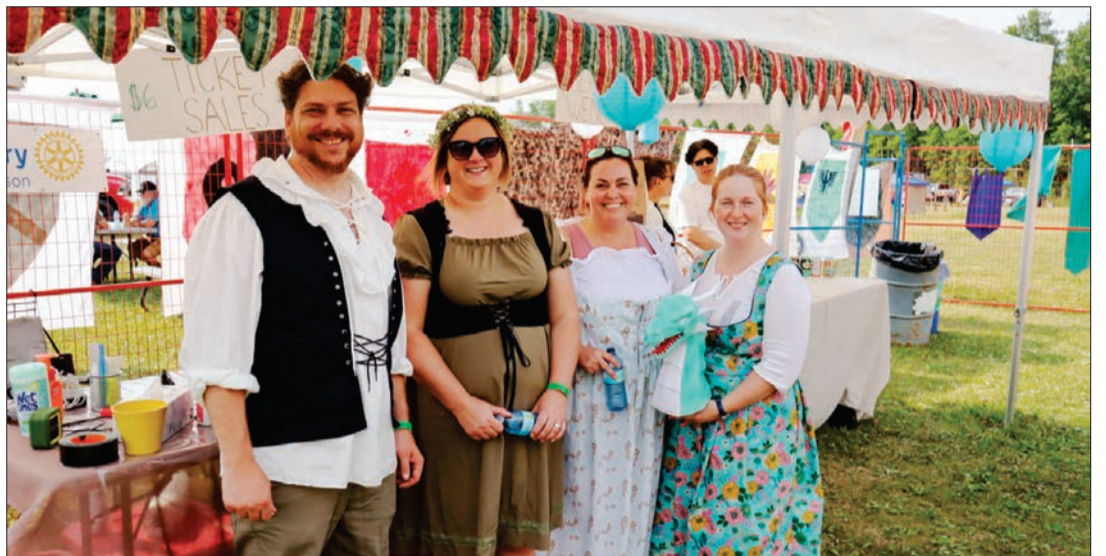
Members of the Edson Rotary Club dressed up to run the 'Grog Garden' at the Renaissance Faire from July 21 to 23. The club was also running a raffle to win a handmade paper dragon.