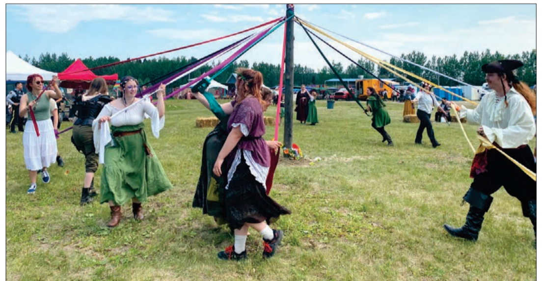
A dance around the maypole was one of the many special events at the Edson Renaissance Faire held at the Yellowhead Ag Grounds. photo submitted.