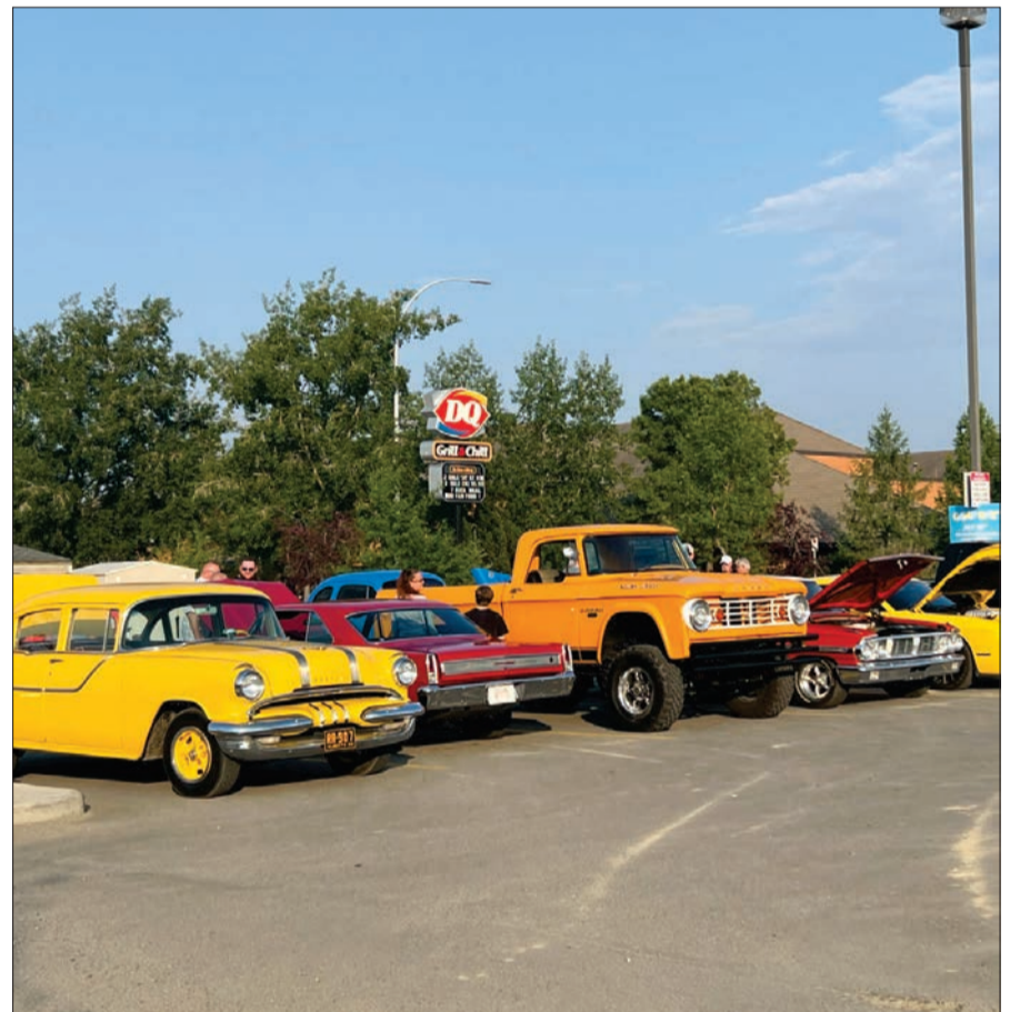
Some beautiful vehicles were parked down by Tim Hortons in the Sobeys parking lot on July 20. Anyone who has a classic vehicle or hotrod is welcome to join in every Thursday night at Sobeys and Saturday nights at A&W. It's a chance to socialize with other enthusiasts and see some great vehicles.

Council voted to approve the unbudgeted expenditure of $80,000 to complete repairs to the McLeod Valley Recreation Area resulting from the recent flood event.