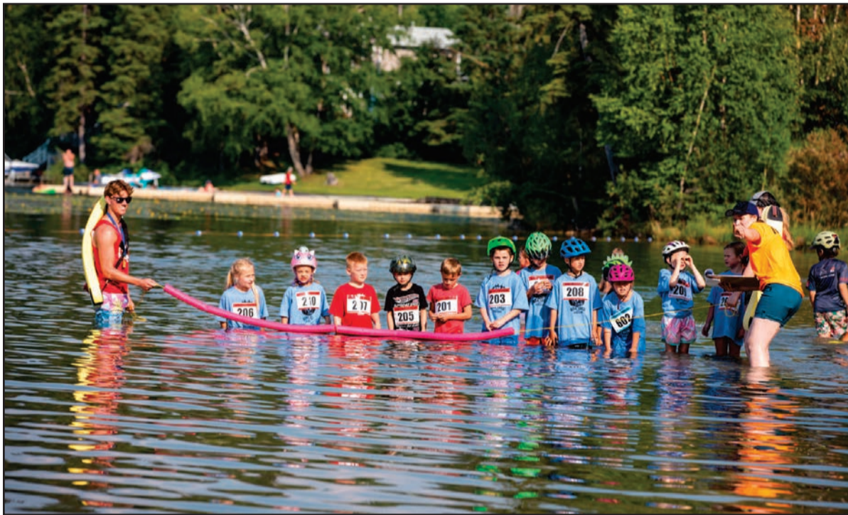
This group was getting ready to start their race at the Bear Chase Triathlon on July 20 at Bear Lake Park.