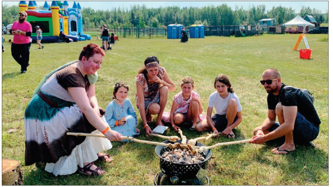
Bannock baking was one of the many activities available at the Edson Renaissance Faire held at the Yellowhead Ag Grounds from July 21 to 23.