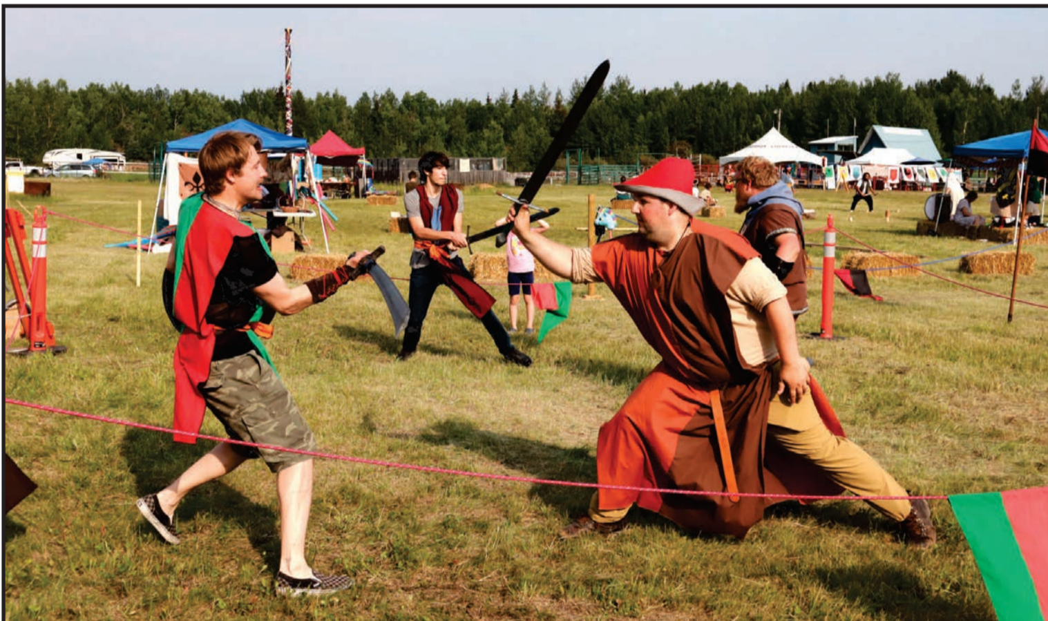
The Red Stags of Red Deer came out to run the Fight a King booth at the Edson Renaissance Faire held at the Yellowhead Ag Grounds. For a small fee anyone could take a 'stab' at the challenge.