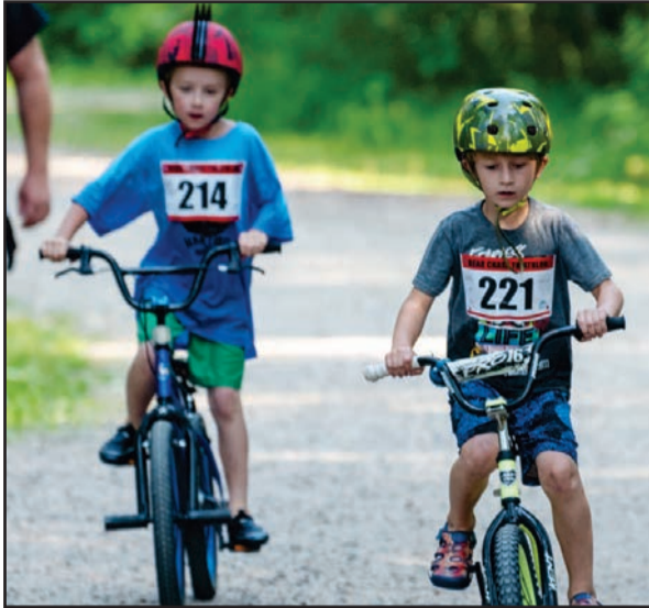
Bear Chase Triathlon heats were organized by age with more categories on July 20 this year.