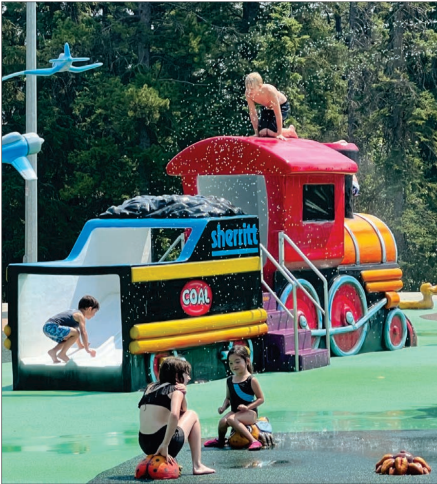
Many families had their kids at the Kinsmen Spray Park during the recent hot weather, making it a great place to cool off.