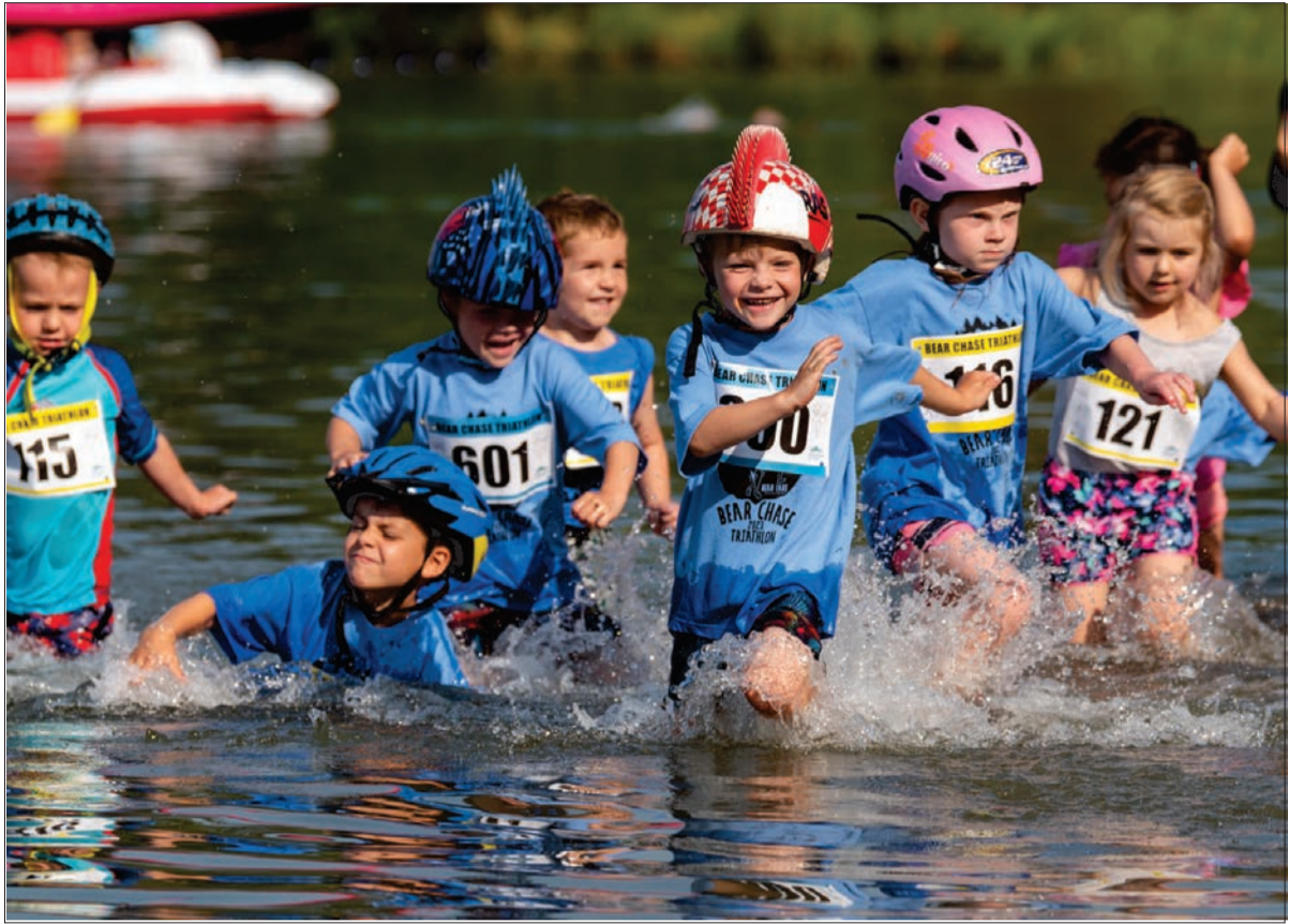
Over 300 people, including families and kids, flocked to Bear Lake Park on July 20 to take part in the annual Bear Chase Triathlon hosted by Yellowhead County.