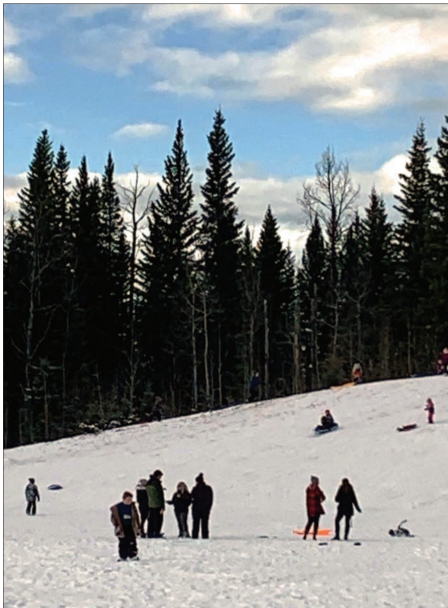
The toboggan hill behind the Yellowhead Koinonia Christian school is a popular place for sledders when the weather is warmer.

More information on the loan can be found at westyellowhead.albertacf.com/business-loans . Business coaching services are available virtually or by phone, and those interested in more information or wanting to book an appointment can call 780-865-1224, visit the Community Futures West Yellowhead website, or reach out on their social media.