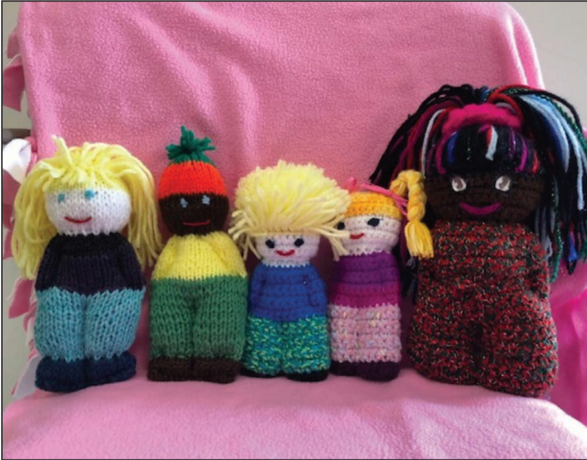
Fibre Friends, a knitting group at the Edson Continuing Care Center, made these Izzy Dolls which will be given to children in need.