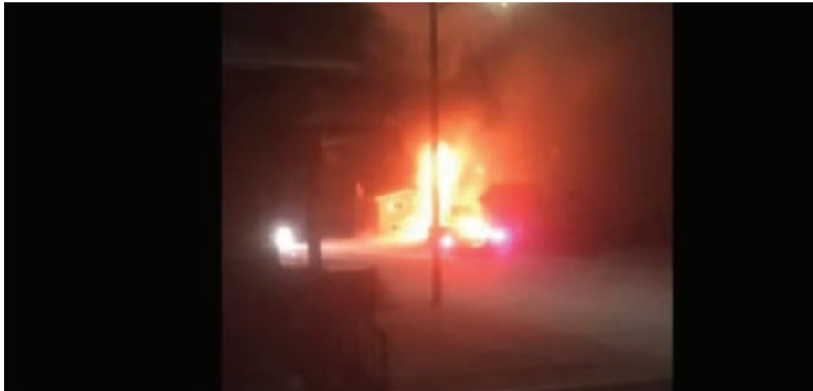
An image from a video posted on YT by 'BoboBear' of the multi-family duplex fire in Evansburg.

On Jan. 26, 2021, shortly after 3 a.m., an Evansburg RCMP officer was patrolling in Evansburg and noticed a multi-family residential duplex on fire in the area of 49 Street and 52 Avenue.