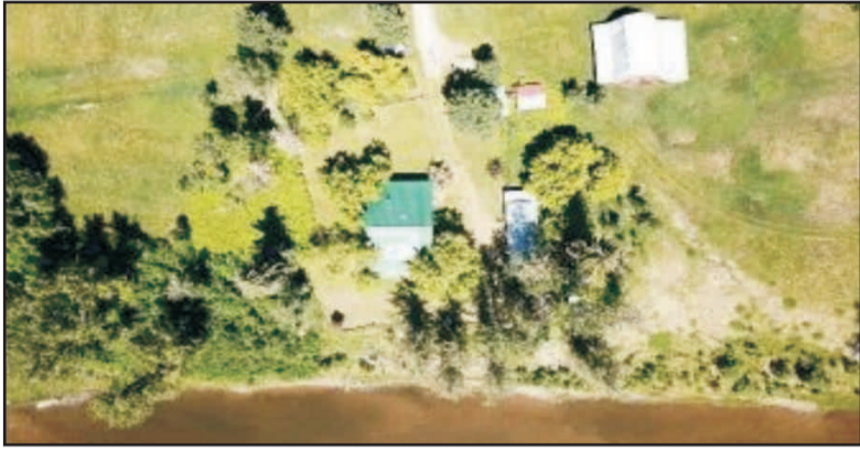
An aerial view of the Big Eddy site.