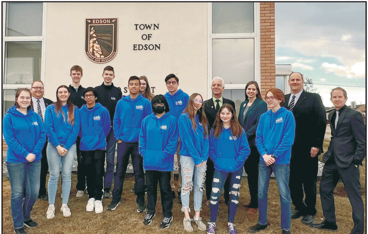
The current Edson Youth Council were able to attend in person for the first time on April 5. The youth presented three initiatives they are coordinating for Earth week. See story page 10.